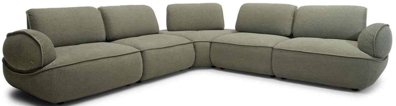
■ Vers. 727+761+790+761+728