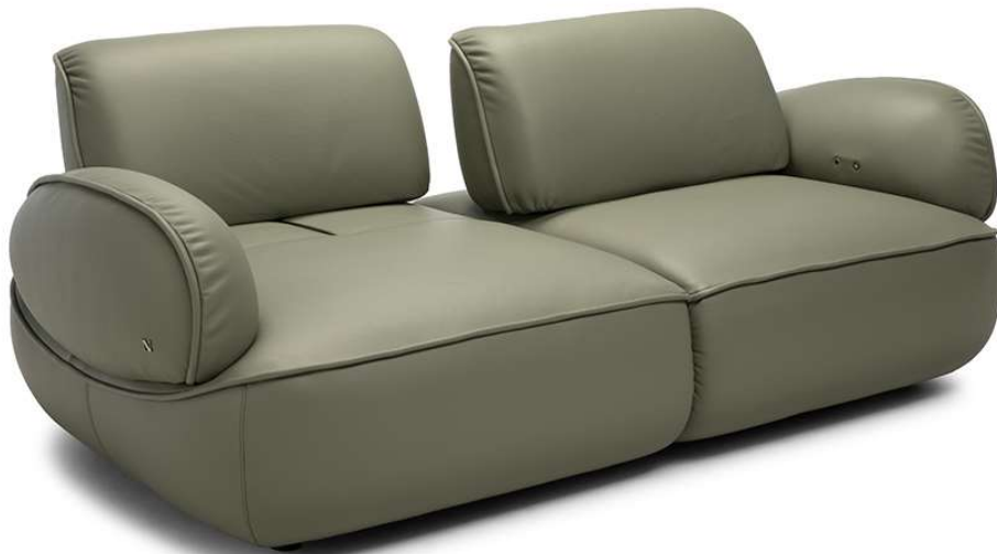
■ Vers. 727+728