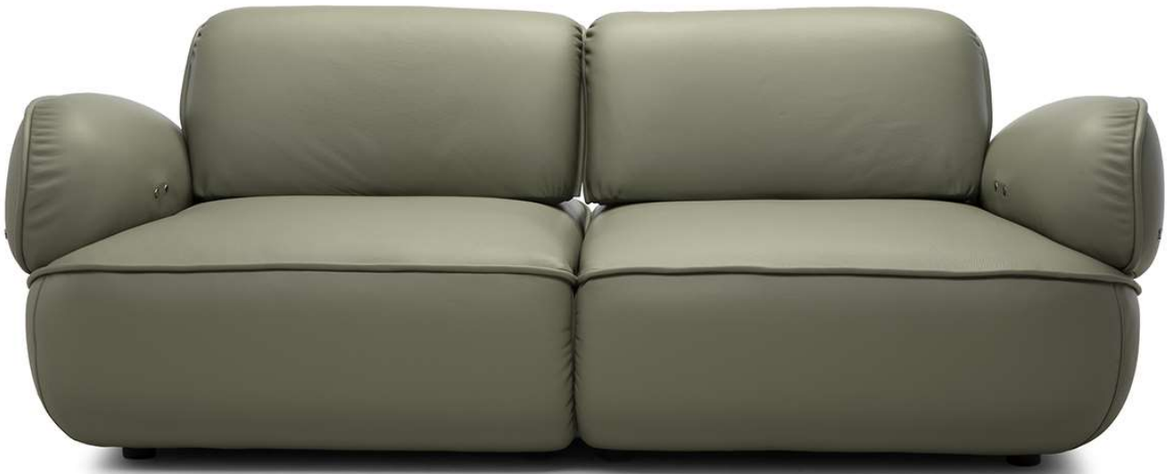
■ Vers. 727+728