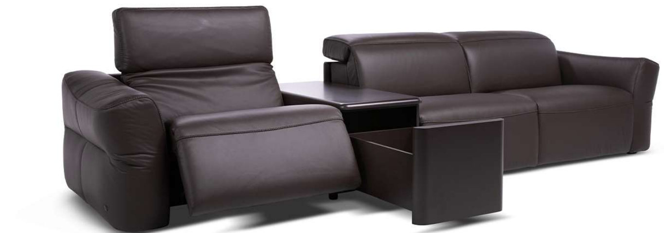
■ Vers. 450+821+338+452