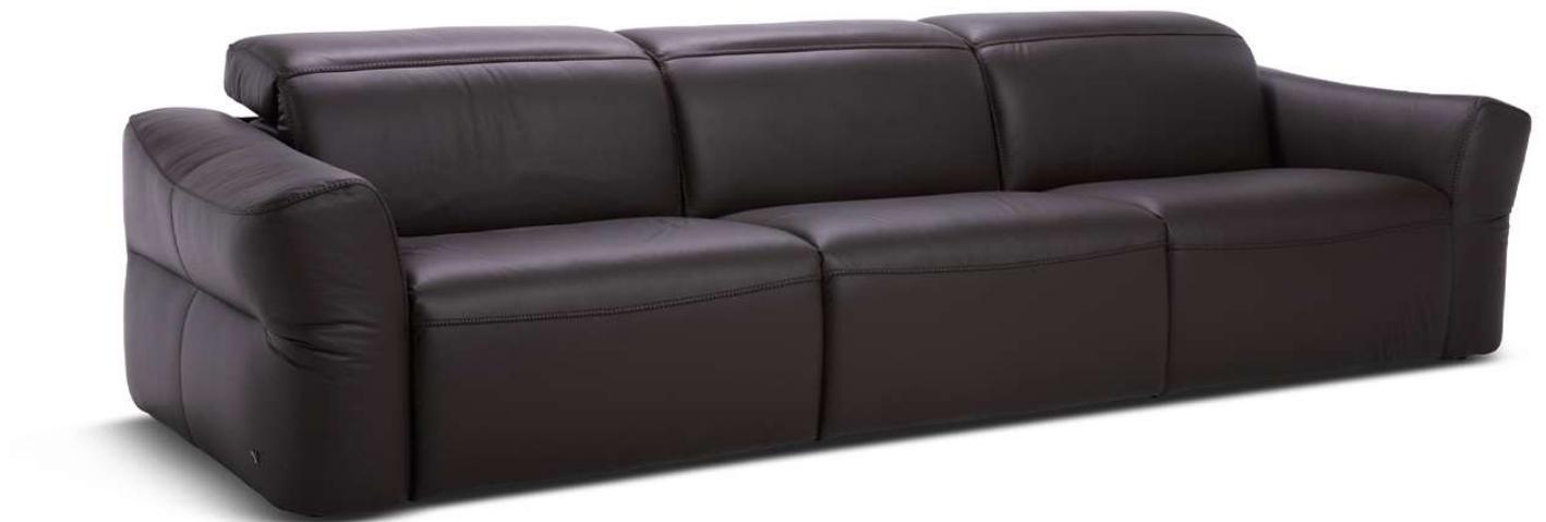
■ Vers. 450+338+452