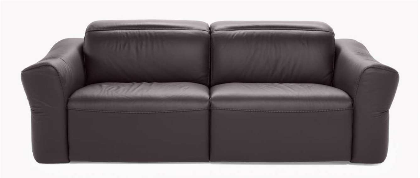
■ Vers. 450+452